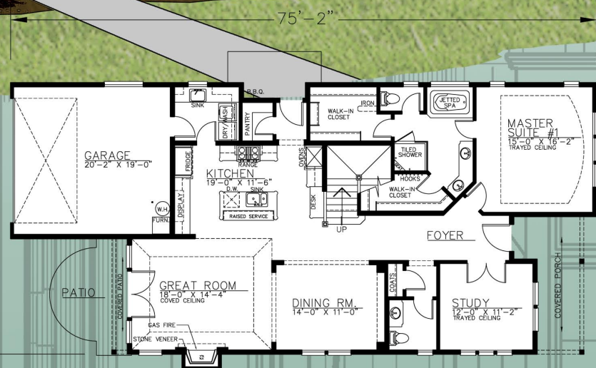
1820 ft 2 MAIN