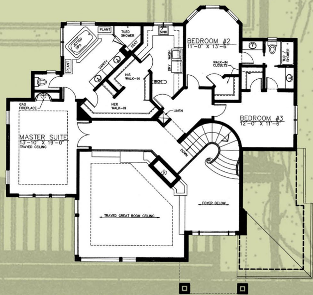
1484 ft 2 UPPER